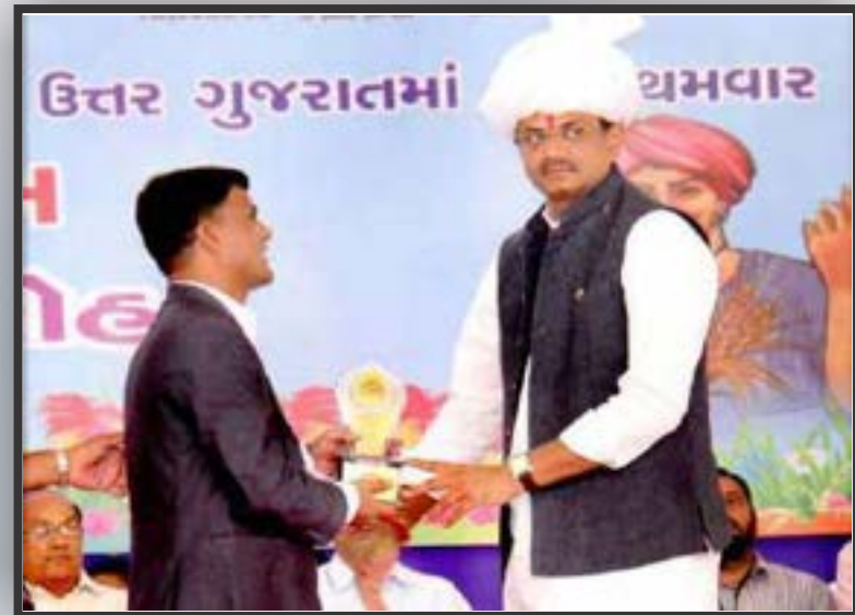
ENTREPRENEURSHIP AWARD IN YEAR-2017