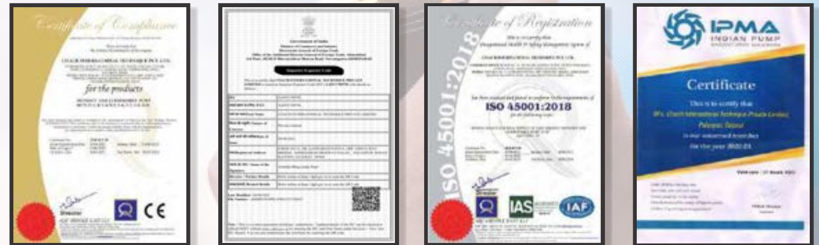
International Certificate of CE