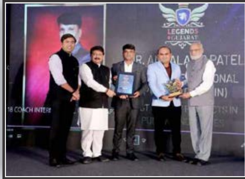
BEST QUALITY PRODUCT AWARD IN PUMPING INDUSTRY - IN YEAR-2022